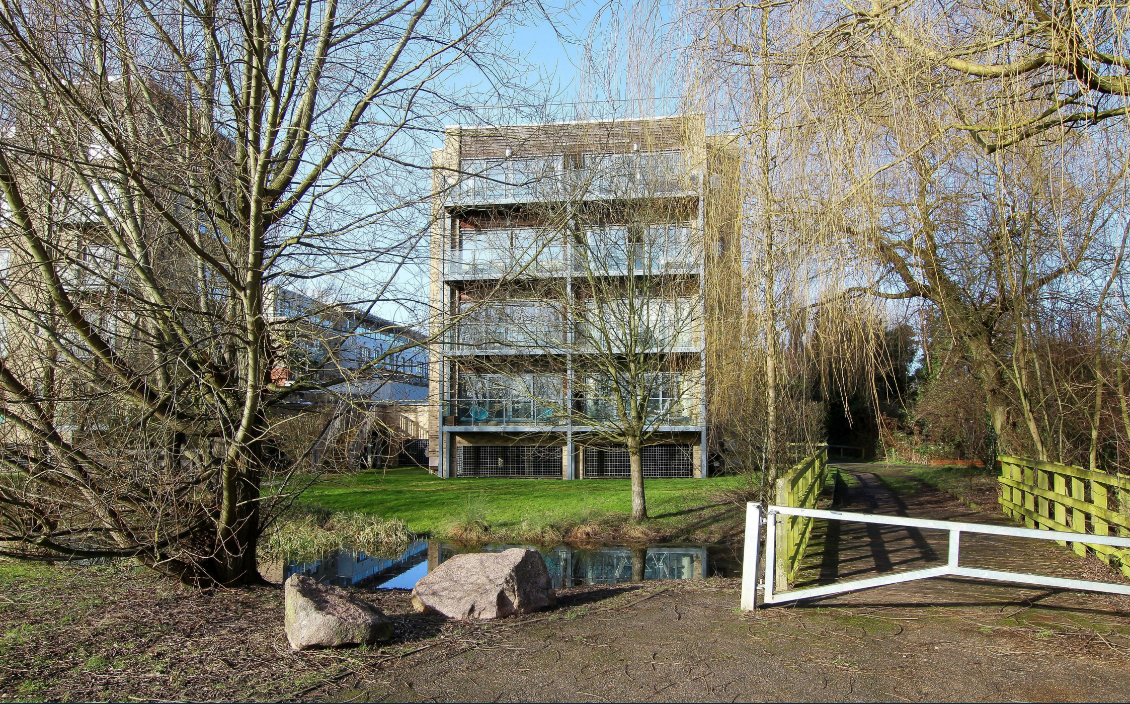
Pepys Court, Cambridge, CB4 1GF